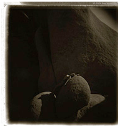
Image Name: Audrey's Spotlight, Joshua Tree National Park Film Type: 85 Film Process/Technique: Positive/Negative Camera: Holga Camera with Polaroid Back