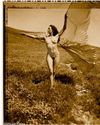
Image Name: Phoenix Film Type: 55 Film - Negative Side Process/Technique: Positive/Negative Camera: Speed Graphic