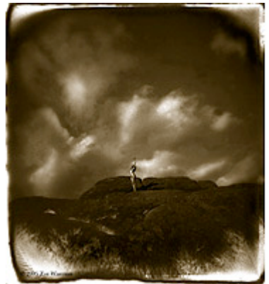
Image Name: Rain Dance Film Type: 85 Film Process/Technique: Positive/Negative Camera: Holga Camera with Polaroid Back